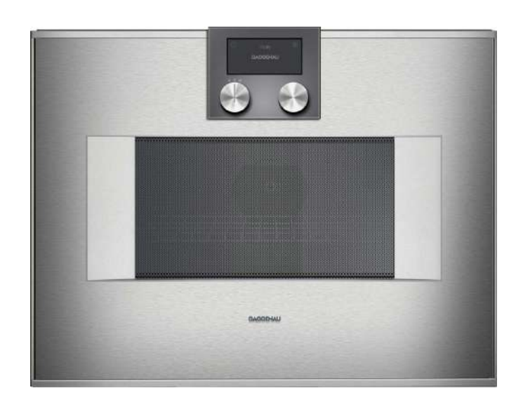
GAGGENAU BM 450