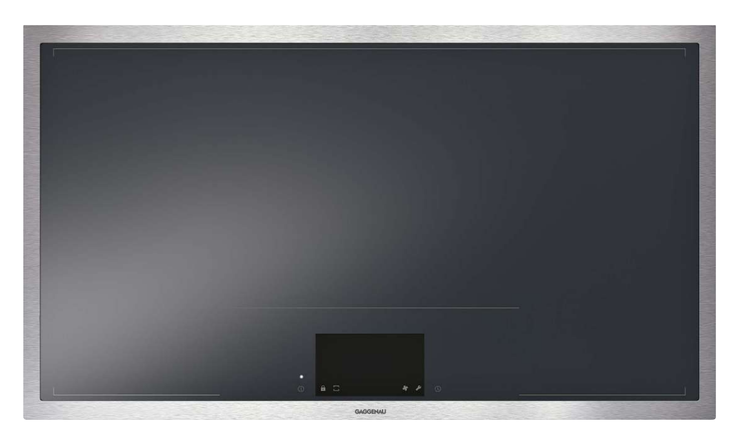
GAGGENAU VARIO 400 SERIES FULL SURFACE INDUCTION COOKTOP.