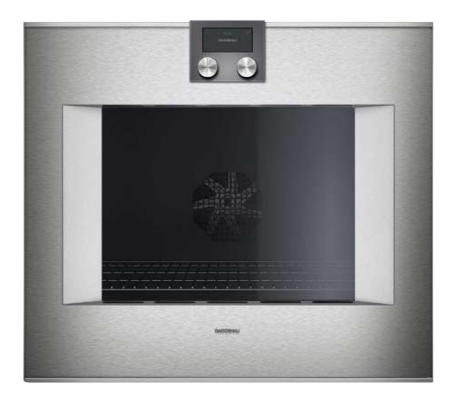
GAGGENAU BO400 SINGLE - OVEN