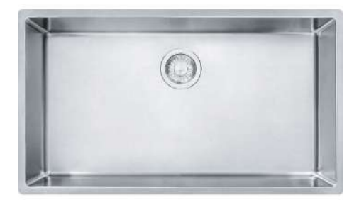
FRANKE - MODEL #CUX11030 / #CUX11027 / #CUX11021

- Franke Cux cube under mount sink stainless single bowl. The new Cube family of handcrafted undermount sinks combines Swiss engineering with sleek, minimalist design. Available in single- and double-bowl styles, the sinks feature a smooth bowl design with a clean look, an easy-to-clean satin finish and sound dampening pads.