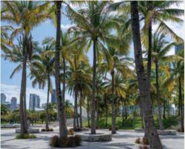
TOP: Miami Beach Golf Club; MIDDLE: South Beach; BOTTOM: Maurice A. Ferré Park Baywalk