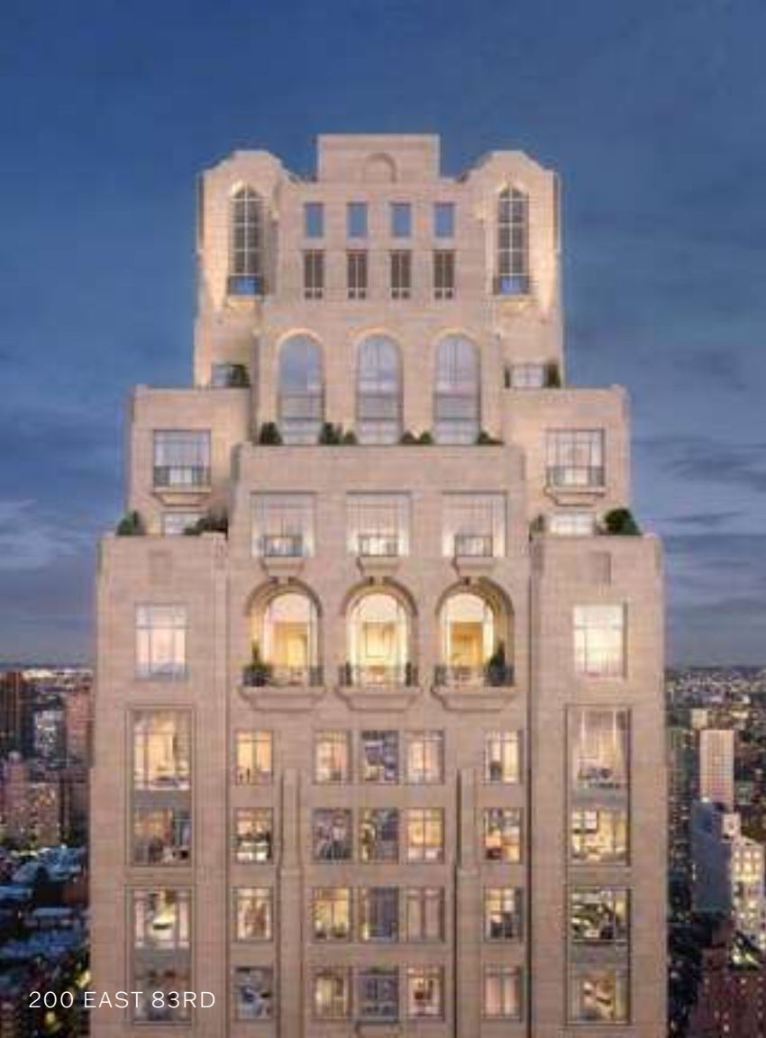
200 EAST 83RD