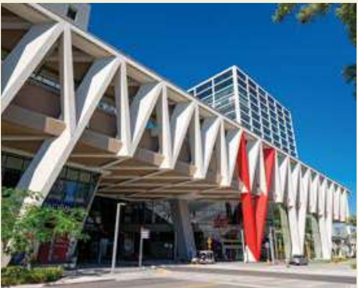
TOP: Miami Metromover; MIDDLE: Brightline; BOTTOM: MiamiCentral Train Station