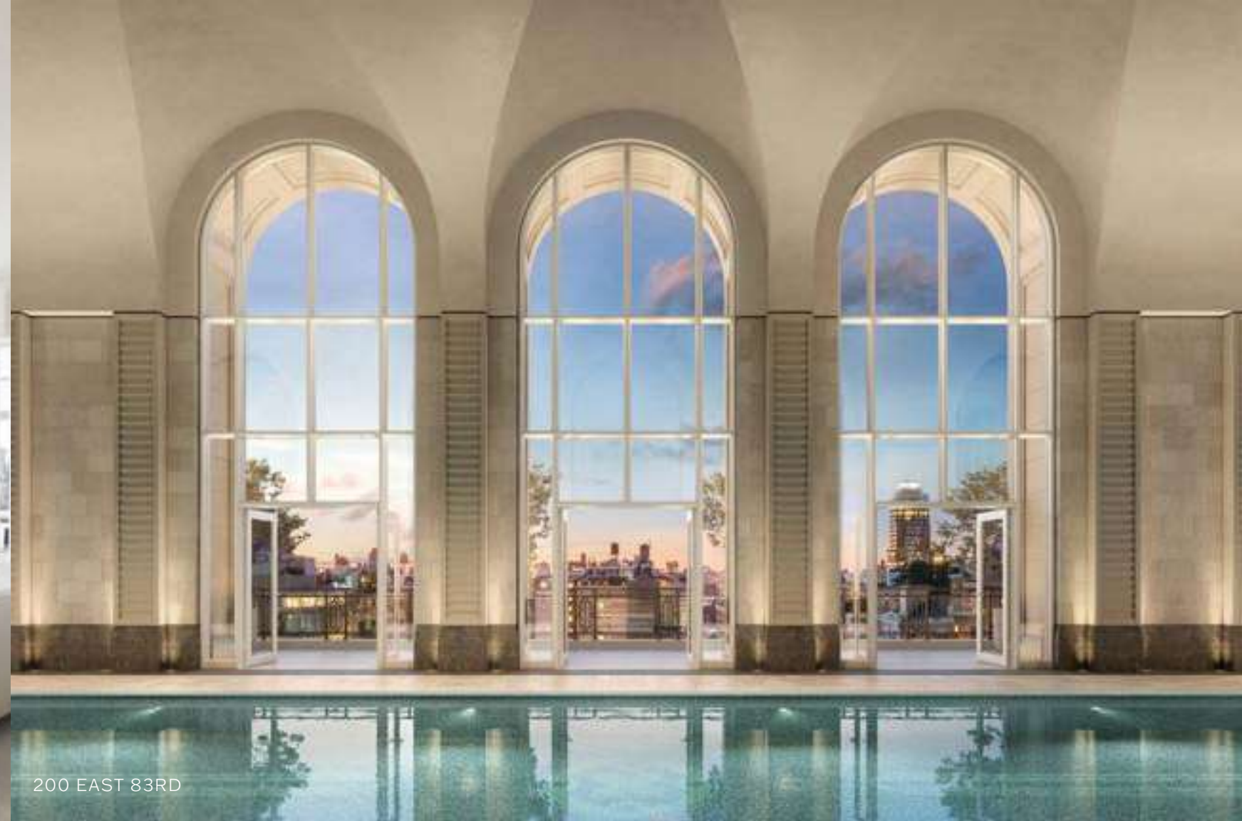
200 EAST 83RD