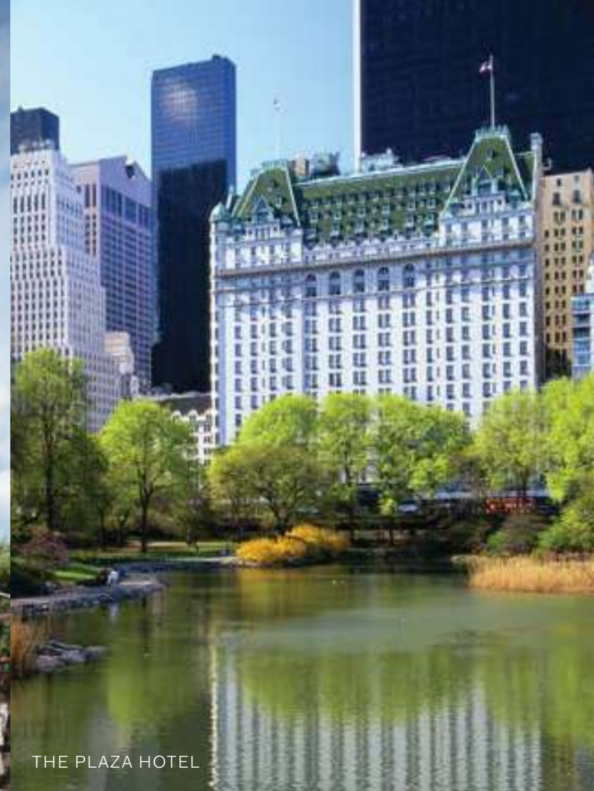
THE PLAZA HOTEL